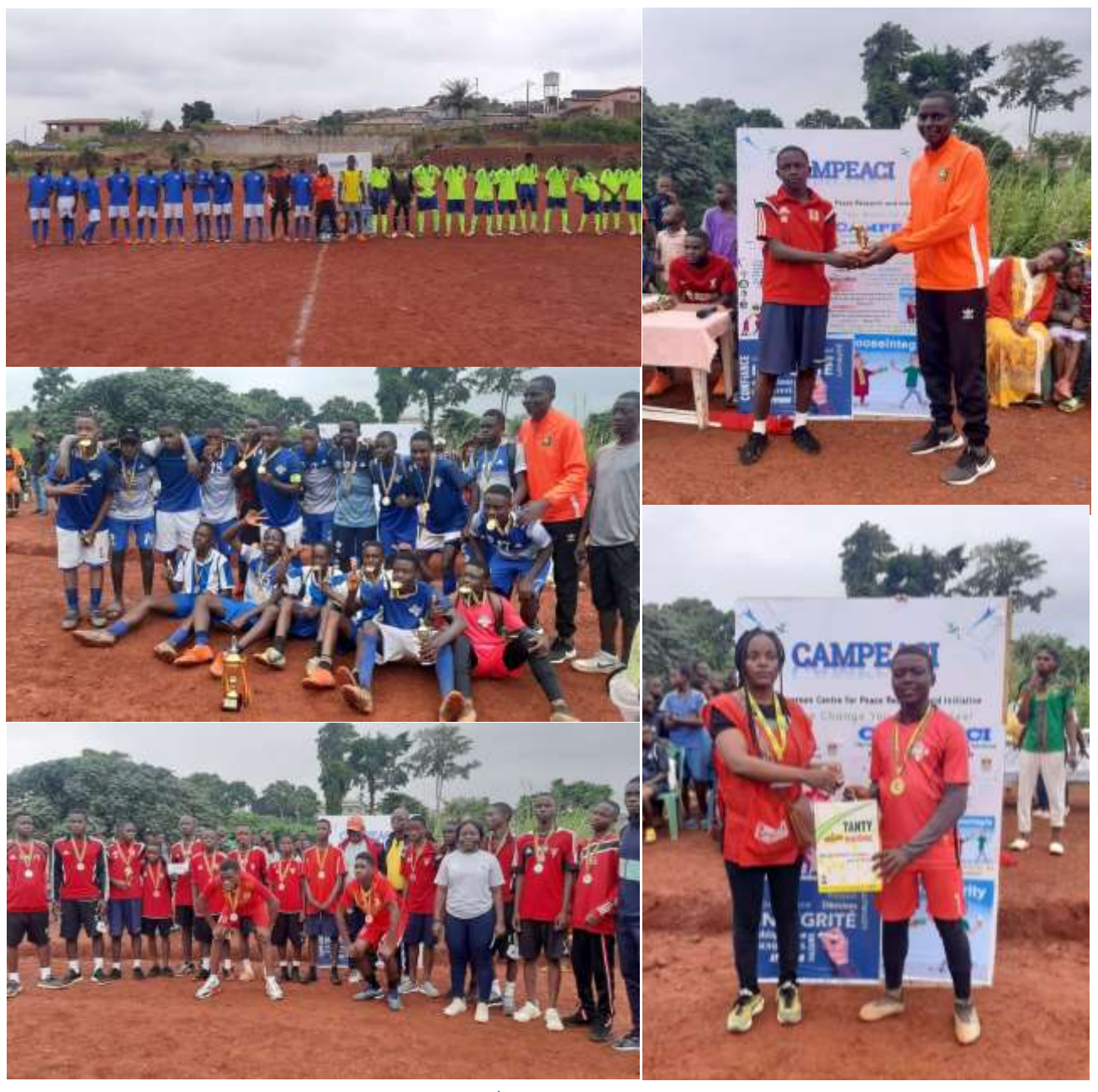
Figure 1: APEJES, Winners of 1st Edition; TAD Academy, runners-up,

The final game was played by Apejes de Mfou against TAD Sports Academy on July, 8<sup>th</sup> 2023 at the Stade Amougou Noma – Messamendogo, in Yaoundé with Apejes de Mfou carrying the day and becoming Champions of the first edition of the tournament.