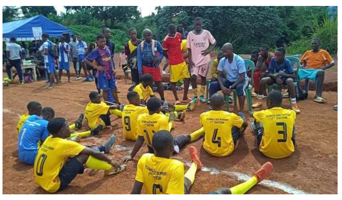
Figure 3: Youth Exchange Session with Coach

While many have erroneously believed that the battle against corruption and other anti-values should be limited to the working class, both private and public