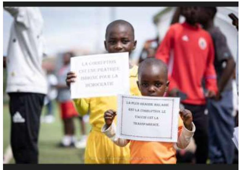
Figure 2: Youths Showcasing Anti-corruption messages

The theory of change that guides this campaign is based on the conviction that if children are exposed to the right information at an early age; if they are made to understand the gravity and