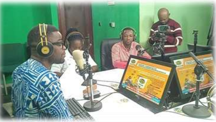
Sensitization campaign on corruption and other anti-values by organizing committee on Radio Fondation Onguene (RFO) before, during and after the tournament

As a buildup to this highly anticipated program, the organizing committee engaged the population of Yaounde and its environs on a sensitization campaign on the ills of corruption